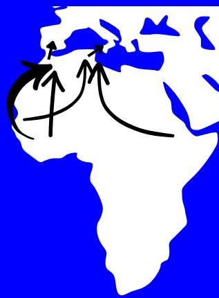
Projected Changes in the Working-Age Population in Sub-Saharan Countries, 2005 to 2050